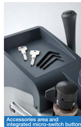
Accessories area and integrated micro-switch button