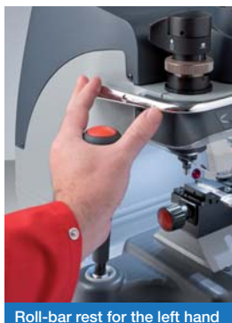
Roll-bar rest for the left hand

The roll-bar rest for the left hand provides the Operator with ideal and comfortable working conditions.