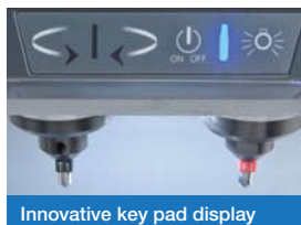
Innovative key pad display

With Matrix One, you will be able to accurately and easily cut a wide range of laser and dimple keys, without the need of optional accessories. Narrow stem vehicle keys and Fichet® type keys can be duplicated with Silca's specific optional adapters.