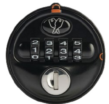
Public Mode Version